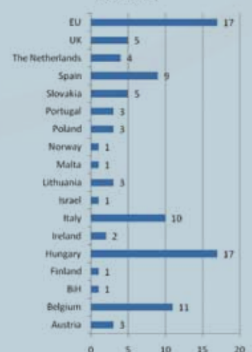
Number of accepted members by country